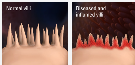
Figure 2: Gut inflammation

B. subtilis PB6 secretes cyclic lipopeptide surfactins through normal metabolism to reduce inflammation.