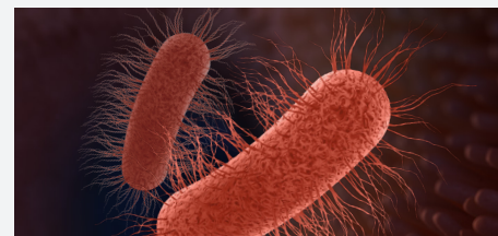
Figure 3: Clostridium

Quorum sensing facilitates the initiation of infection, colonization and disease progression in the intestine where diffusible signaling molecules are produced, secreted and detected by the bacterial cells in the intestine. 5-8 Quorum quenching is the mode of action that can disrupt the quorum sensing system through degradation of quorum sensing signaling molecules, the inhibition of signal biosynthesis and the inhibition of signal detection. 9 Quorum quenching also aids in the prevention of toxin production and formation of biofilm. 3 B. subtilis PB6 can prevent quorum sensing of C. perfringens .